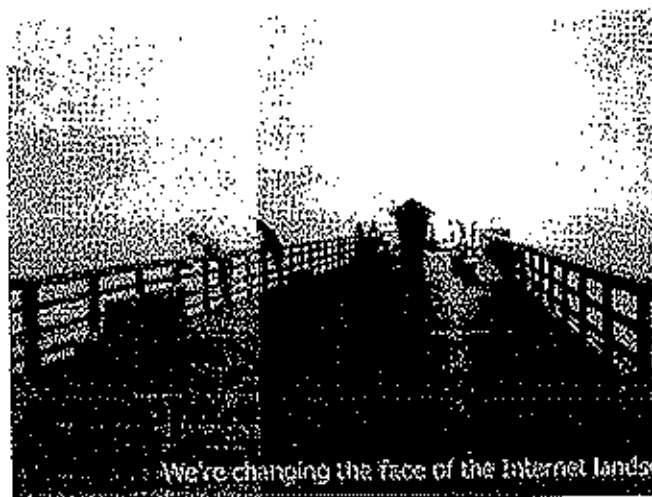
We're changing the face of the Internet landscape

NameClub, FMA on the world stage has one of the largest privately held inventory of internet domains exceeding 100,000. We proudly host and sponsor nameclub.com, an Arabic language forum for industry leaders in the Arab community committed to the exchange of information on developing trends in domain ownership.